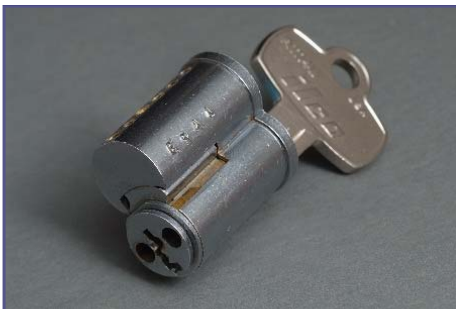
Figure 5. Best SFIC core with control key.

Operating keys (which can be, and typical are, mastered) rotate the lock plug. Note the two holes at the back of the plug in Figure 4, which mate with the fingers in the housing, and the retaining tab (running halfway along the length of the core), which locks the core into the housing (and which remains in the locked state when an operating key is used).