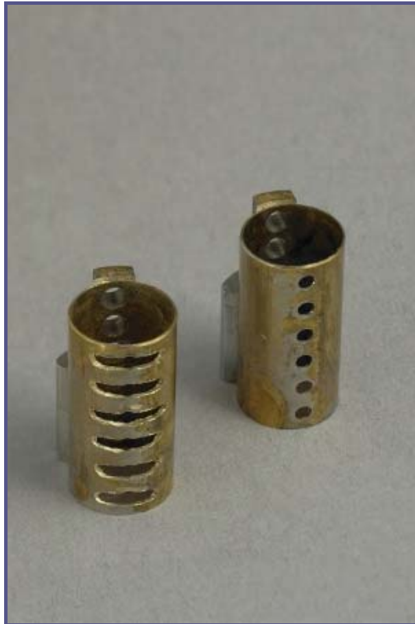
Figure 11. Modified control sleeve.

The pins in Figure 10 are for a six pin lock, mastered at the operating shear line with a TPP format and not mastered at the control shear line (this is a typical configuration). Note that each pin stack has four segments (producing two operating cuts and one control cut).