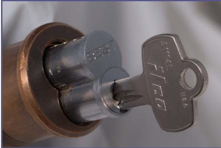
Figure 2. Removing an SFIC core

locks are slightly smaller than those used in conventional cylinders, and tolerances are comparatively tight. A variety of depth systems are used, supporting up to 10 distinct biting heights per pin position with no MACS restriction. This allows up to 10,000,000 distinct keys per keyway (although there are effectively fewer in practice, due to tolerance errors and phantom keys in master systems).