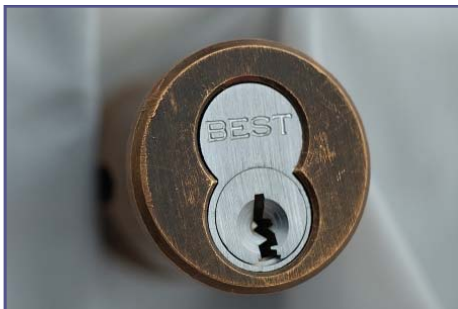
Figure 1. A Best SFIC lock cylinder.

"Small Format Interchangeable Core (SFIC)" locks, first made by Best Access Systems, are popular with medium- and large- scale institutional lock users in the US. These locks offer moderate resistance against manipulation and forceful attack, support large master key systems, are of good general quality, and are available for a wide range of lock configurations. The most important feature of these cylinders, however, is the ease with which the end-user can manage them. A special control key unlocks and allows removal from the front of the lock of the core , which contains the keyway and pins. New cores can be swapped in and out in a few seconds as required, without the need for tools or special locksmithing skills. Most users keep on hand a supply of extra cores that are rotated through to support routine re-keying.