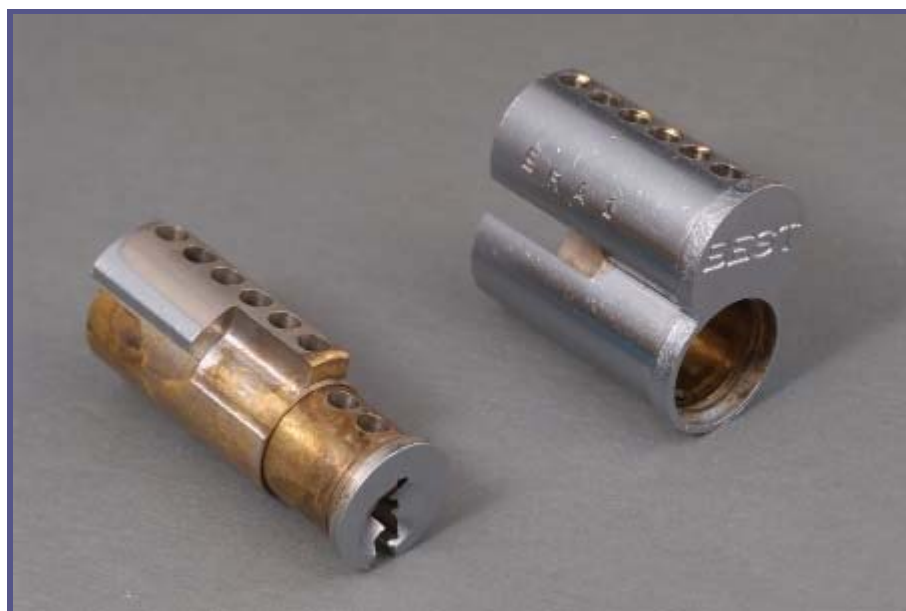
Figure 6. SFIC core parts breakdown.

degrees but also disengage the retaining tab (shown in Figure 5 in the unlocked state), allowing the core to be pulled out from or installed into a lock housing.