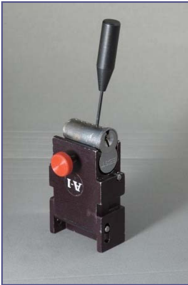
Figure 9. A-1 SFIC pin ejector/decoder tool.

A special tool ejects the pins through the top of the core (no disassembly with a follower tool is required) and allows decoding. The model in Figure 9 is made by A-1; other vendors produce similar devices.