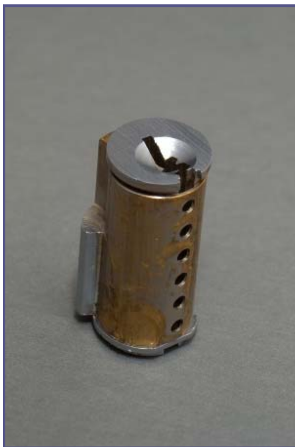
Figure 7. Bottom of SFIC plug.

designs are not typically used (though Best now offers them as an option).