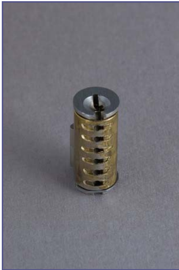
Figure 12. Modified control sleeve with plug.

I devised a simple modification to the control sleeve to prevent the use of the Finch-style torque tool. Wider holes in the control sleeve do not give the torque tool's fingers a surface to engage but still allow the insertion of the ejector pin. (The crude prototype in Figures 11 and 12 was done by hand with a Dremel tool, but still works). Obviously, it would be preferable if the manufacturers modified the design of the sleeves in a similar way. (Actually, newer Arrow cores do not suffer from this weakness, as the control sleeve does not go all the way to around the plug.)