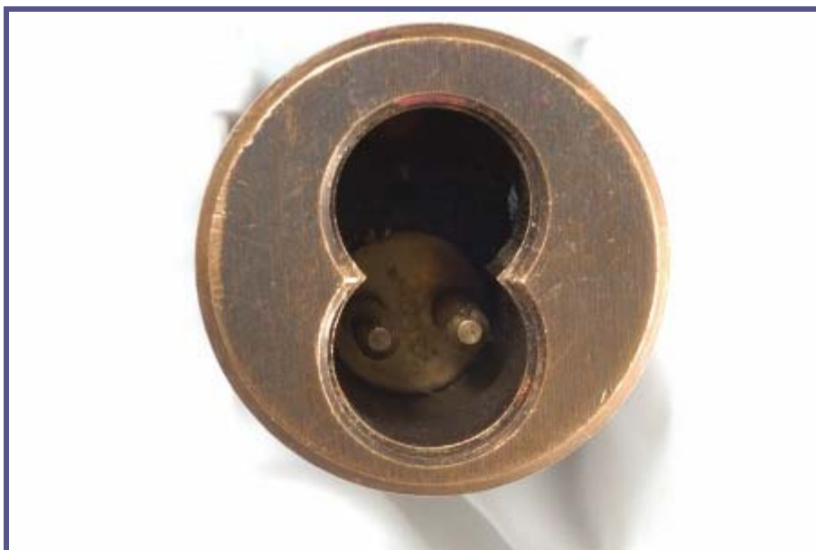
Figure 3. SFIC cylinder housing.

The control key (cut on the same blank and otherwise indistinguishable from a regular key) turns about 20 degrees clockwise to disengage a retaining tab that locks the core in the housing. The core pulls out while the housing stays in place in the door (the one shown in Figure 2 is a standard-size screw-in mortise cylinder).