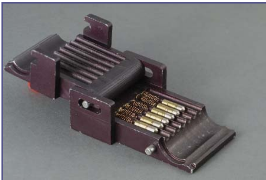
Figure 10. Decoding SFIC pins.

A special tool ejects the pins through the top of the core (no disassembly with a follower tool is required) and allows decoding. The model in Figure 9 is made by A-1; other vendors produce similar devices.