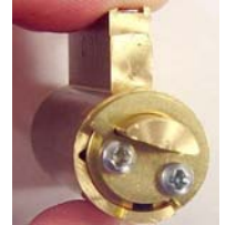
Cylinder Back with Driver