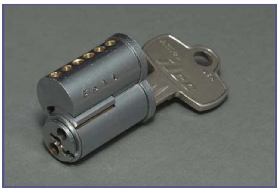
Figure 4. Best SFIC core with operating key.

Housings for SFIC locks have two fingers (extending about halfway down the length of the cylinder) that engage the core's plug and that are linked with the locking mechanism. In addition to standard mortise cylinders, SFIC housings are also manufactured for rim cylinders, key-in-knob locks, padlocks, cabinet locks, electrical switches, etc.