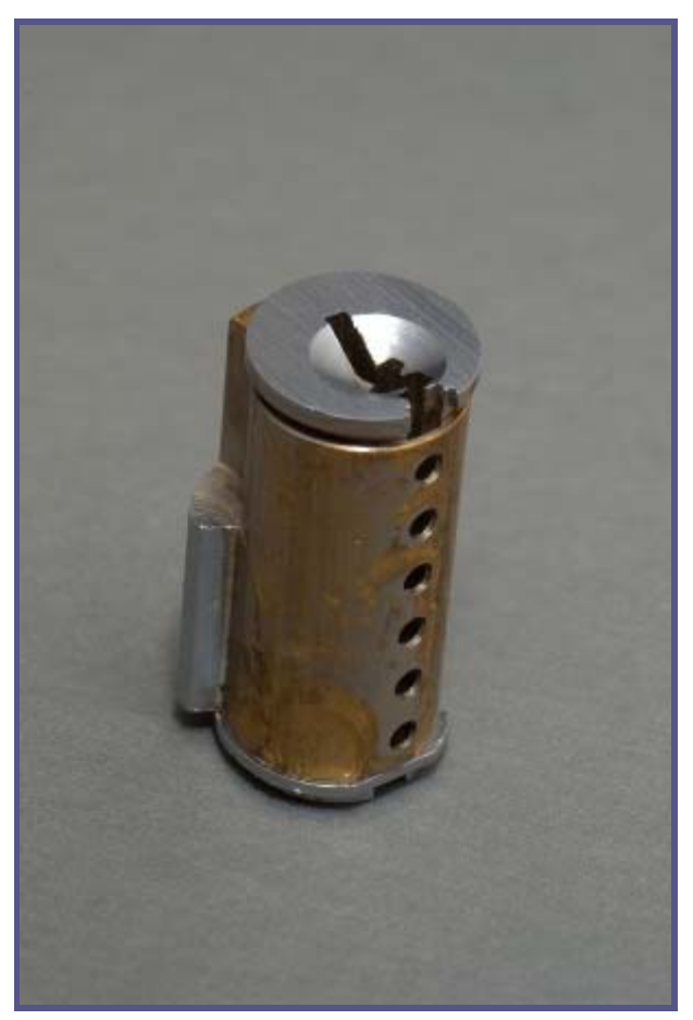
Figure 7. Bottom of SFIC plug.

designs are not typically used (though Best now offers them as an option).