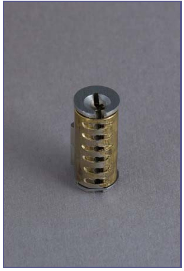
Figure 12. Modified control sleeve with plug.

I devised a simple modification to the control sleeve to prevent the use of the Finch-style torque tool. Wider holes in the control sleeve do not give the torque tool's fingers a surface to engage but still allow the insertion of the ejector pin. (The crude prototype in Figures 11 and 12 was done by hand with a Dremel tool, but still works). Obviously, it would be preferable if the manufacturers modified the design of the sleeves in a similar way. (Actually, newer Arrow cores do not suffer from this weakness, as the control sleeve does not go all the way to around the plug.)