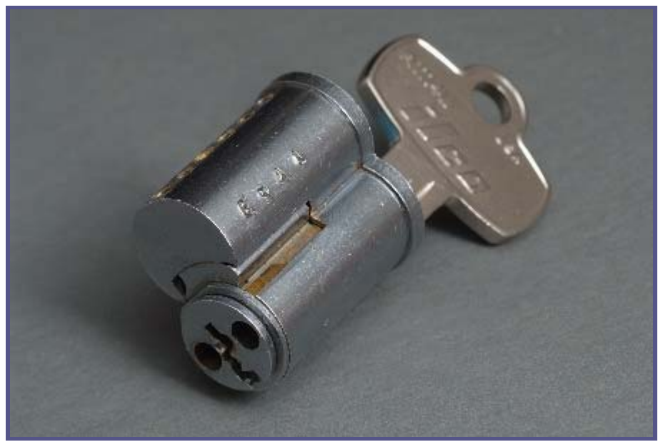
Figure 5. Best SFIC core with control key.

Operating keys (which can be, and typical are, mastered) rotate the lock plug. Note the two holes at the back of the plug in Figure 4, which mate with the fingers in the housing, and the retaining tab (running halfway along the length of the core), which locks the core into the housing (and which remains in the locked state when an operating key is used).