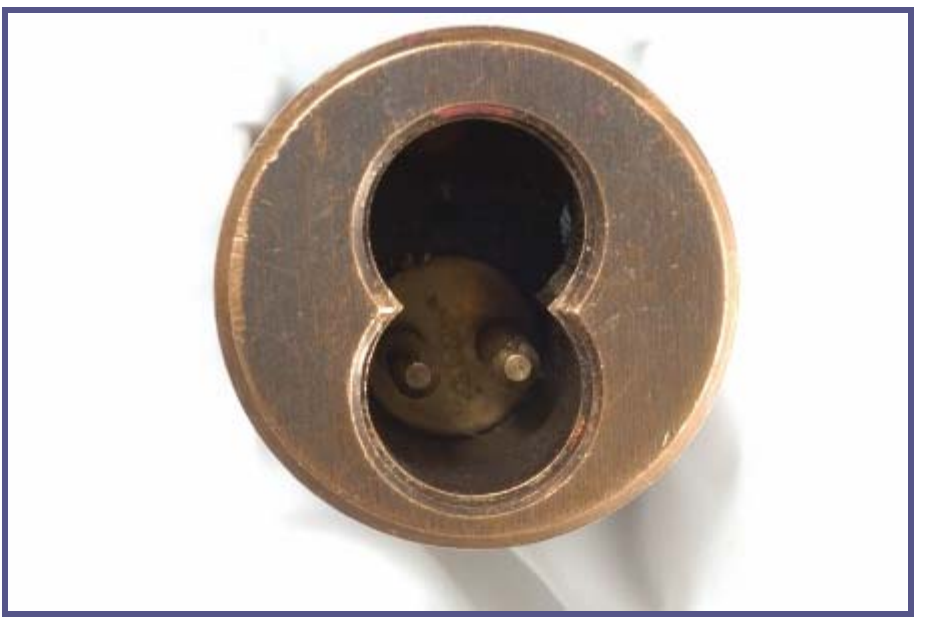
Figure 3. SFIC cylinder housing.

The control key (cut on the same blank and otherwise indistinguishable from a regular key) turns about 20 degrees clockwise to disengage a retaining tab that locks the core in the housing. The core pulls out while the housing stays in place in the door (the one shown in Figure 2 is a standard-size screw-in mortise cylinder).