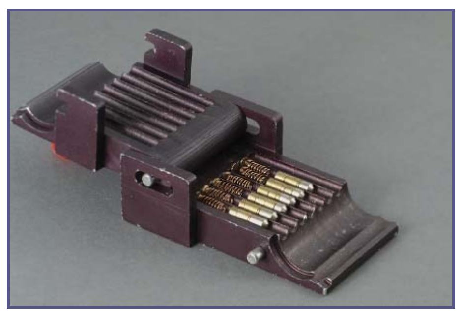
Figure 10. Decoding SFIC pins.

A special tool ejects the pins through the top of the core (no disassembly with a follower tool is required) and allows decoding. The model in Figure 9 is made by A-1; other vendors produce similar devices.