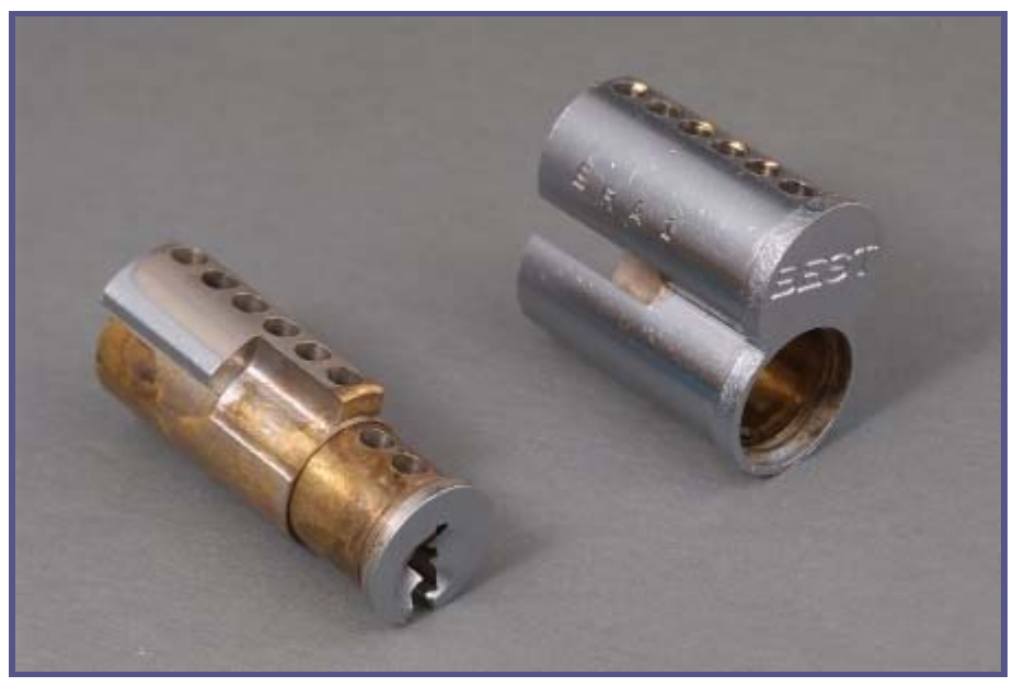
Figure 6. SFIC core parts breakdown.

degrees but also disengage the retaining tab (shown in Figure 5 in the unlocked state), allowing the core to be pulled out from or installed into a lock housing.