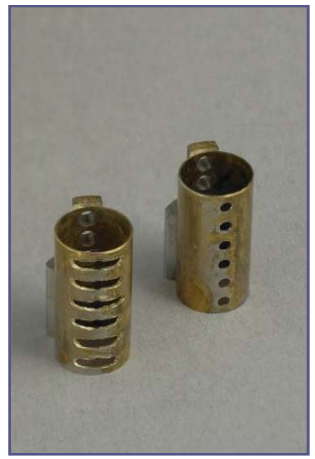
Figure 11. Modified control sleeve.

The pins in Figure 10 are for a six pin lock, mastered at the operating shear line with a TPP format and not mastered at the control shear line (this is a typical configuration). Note that each pin stack has four segments (producing two operating cuts and one control cut).