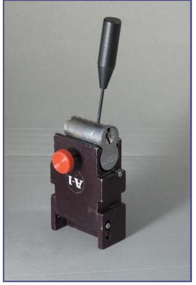
Figure 9. A-1 SFIC pin ejector/decoder tool.

A special tool ejects the pins through the top of the core (no disassembly with a follower tool is required) and allows decoding. The model in Figure 9 is made by A-1; other vendors produce similar devices.