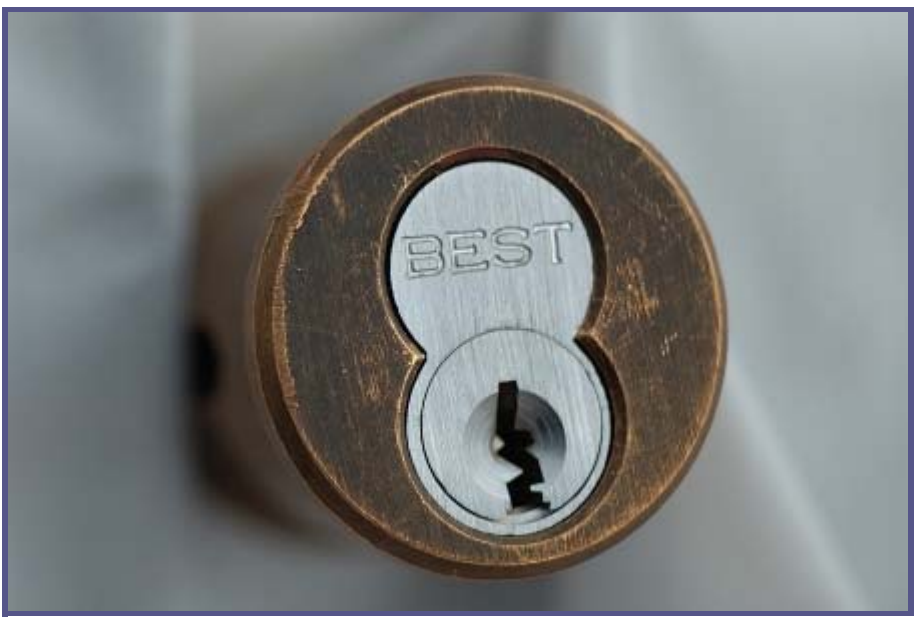
Figure 1. A Best SFIC lock cylinder.

"Small Format Interchangeable Core (SFIC)" locks, first made by Best Access Systems, are popular with medium- and large- scale institutional lock users in the US. These locks offer moderate resistance against manipulation and forceful attack, support large master key systems, are of good general quality, and are available for a wide range of lock configurations. The most important feature of these cylinders, however, is the ease with which the end-user can manage them. A special control key unlocks and allows removal from the front of the lock of the core , which contains the keyway and pins. New cores can be swapped in and out in a few seconds as required, without the need for tools or special locksmithing skills. Most users keep on hand a supply of extra cores that are rotated through to support routine re-keying.